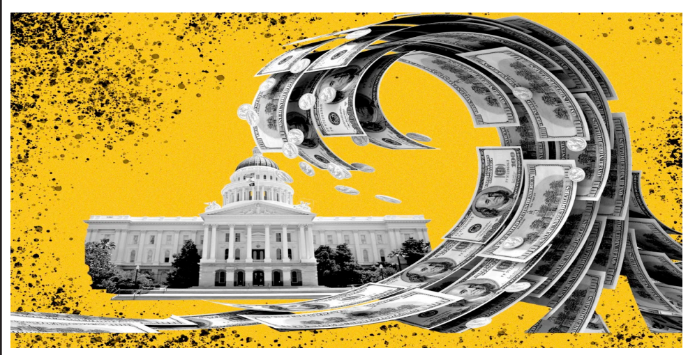
Illustration by Anne Wernikoff, CalMatters; iStock

Continued from page 1 The debt is expected to top $20 billion by the end of the year and if not repaid, the federal government will raise payroll taxes on California employers until it is paid, with interest. That's what happened after California borrowed about $10 billion during the 2007-12 recession. In this case, however, the recession resulted from Newsom's order to shut down businesses to battle COVID-19. Therefore, the debt should be fairly shouldered by the state as a cost of fighting the pandemic, rather than by employers still struggling to recover from recession. It may lack political sex appeal, but it's the right thing to do. SOURCE: https://calmatters.org/commentary/2021/11/california-budget-surplus-spending-newsom/