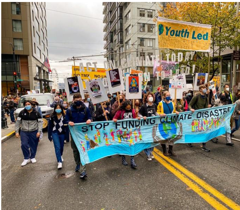
A coalition of groups, including future coalition and 350 Seattle helped mobilize hundreds of youth activists who took over several blocks in Seattle, Friday, October 29.

Yet major banks and insurance companies continue to underwrite and insure new coal and oil and gas extraction and infrastructure. A report released in March found that since the Paris Agreement in 2015, the world’s 60 biggest banks have funded almost $4 trillion worth of new fossil fuel projects. The new youth campaign includes pledges not to bank or work for