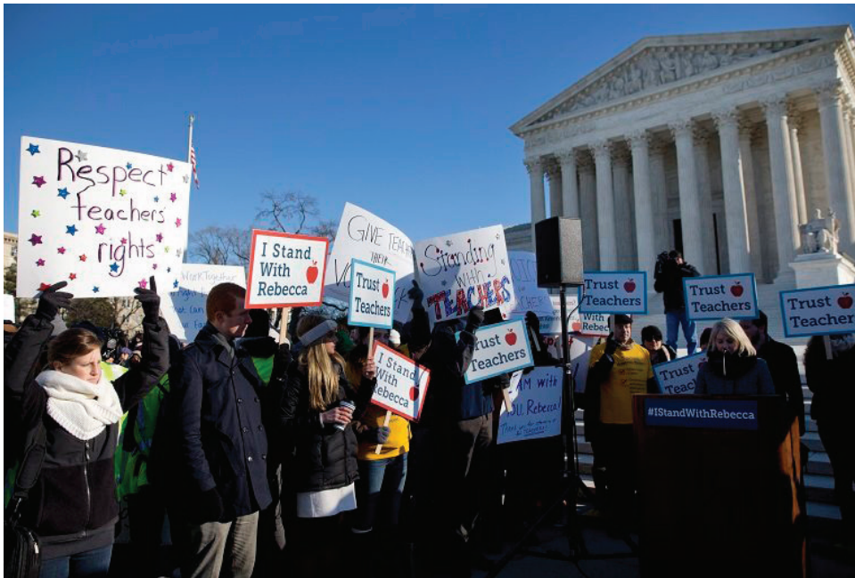
Protesters outside the U.S. Supreme Court, as the justices heard arguments in the Friedrichs v. California Teachers Association case.