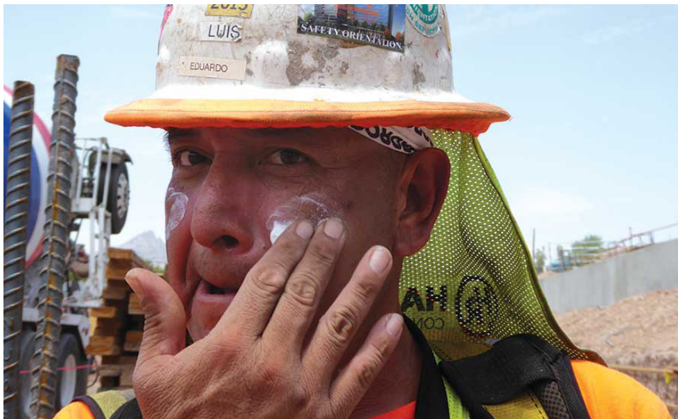
A construction tradesworker applies sunscreen at a foundation project in the Phoenix area, where the temperatures routinely top 100° F and work starts early to limit exposure.