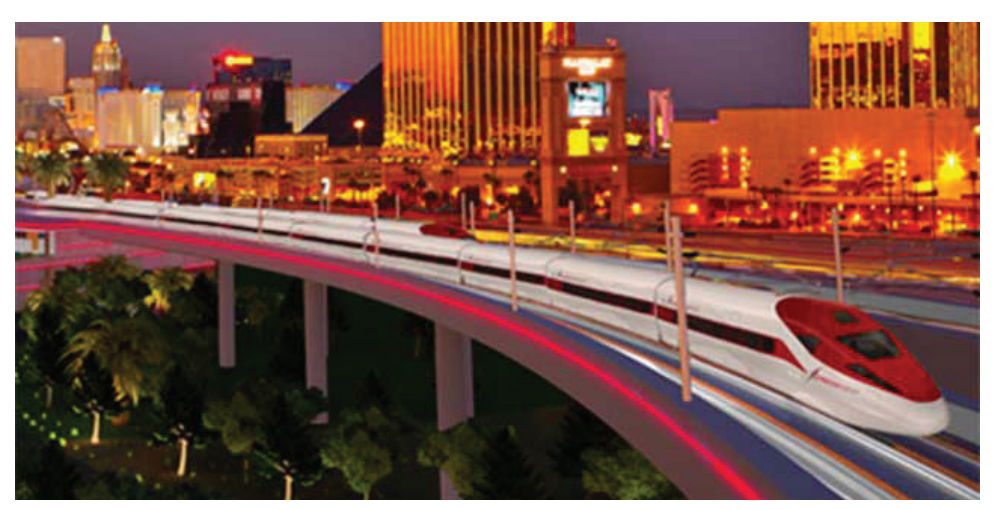
The planned XpressWest high-speed train is depicted at a station in Las Vegas in this artist's rendering. (Source: XpressWest.com)