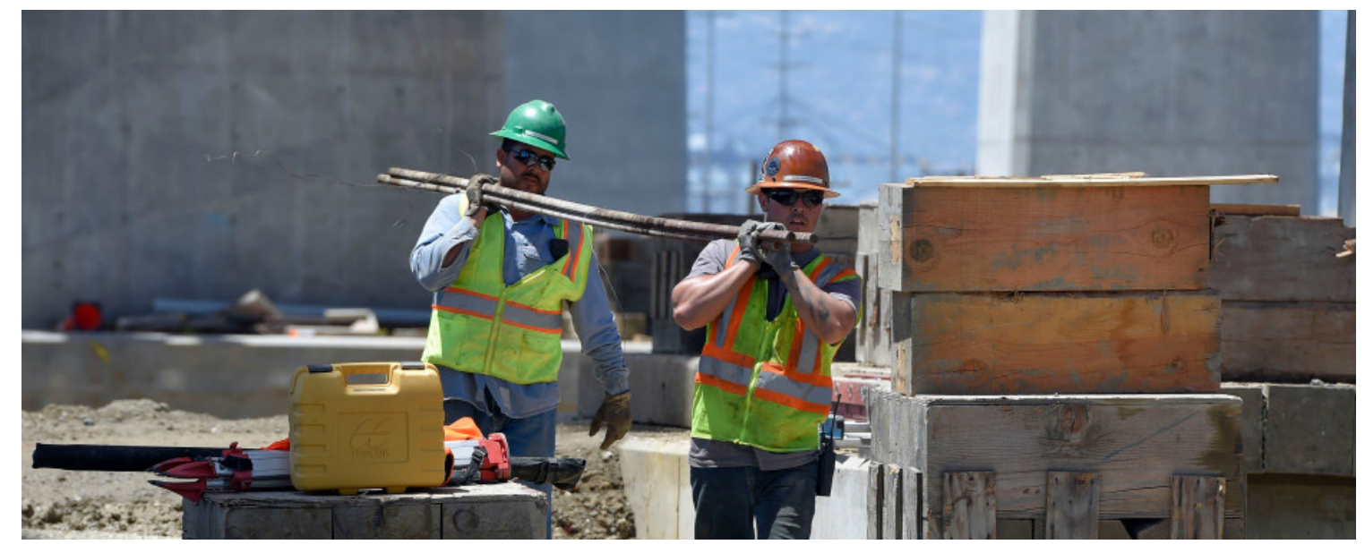
California contractors are feeling good about 2018, but they're having a hard time finding enough skilled workers.