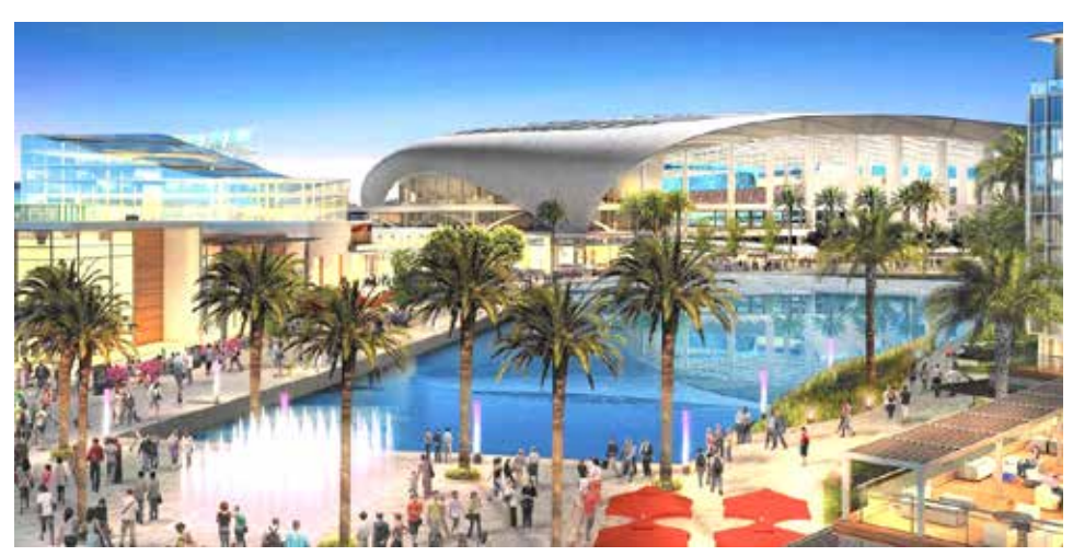
An artist's rendering shows the planned City of Champions Revitalization Project in Inglewood, where the owner of the St. Louis Rams plans to build an NFL stadium.

The Inglewood site Kroenke bought last year is too small for a stadium and parking, but the deal with Stockbridge, the neighboring developer, provides ample space. "We are excited to unveil an