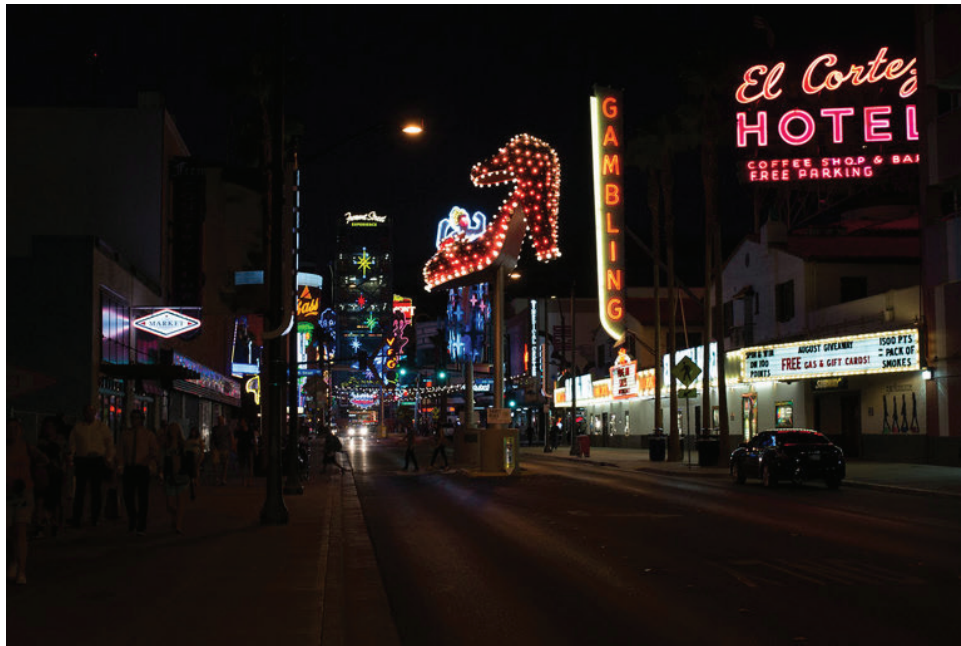
The Las Vegas Strip

Younger companies are crucial to creating jobs and promoting innovation in local economies.